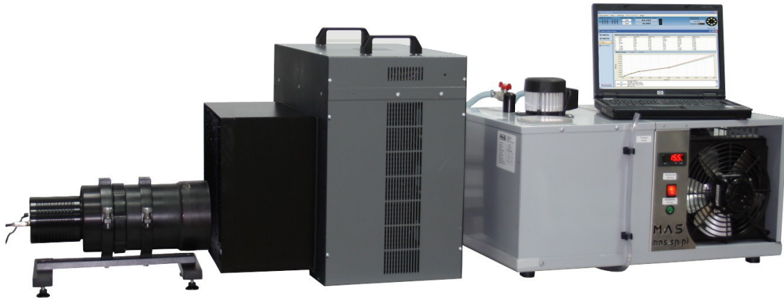
Fig.1. Photo of BLIQ-12D blackbody